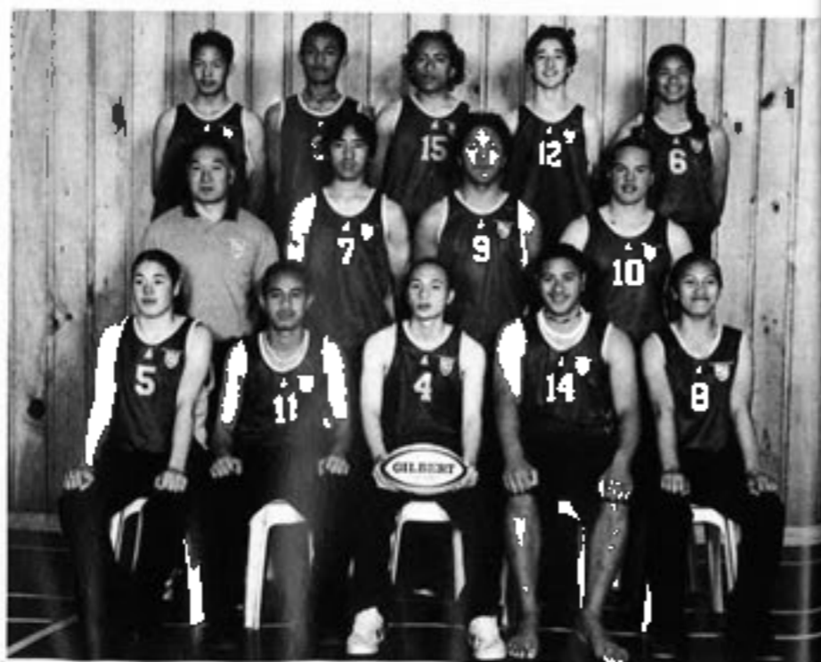
T.H.S. Mixed Touch